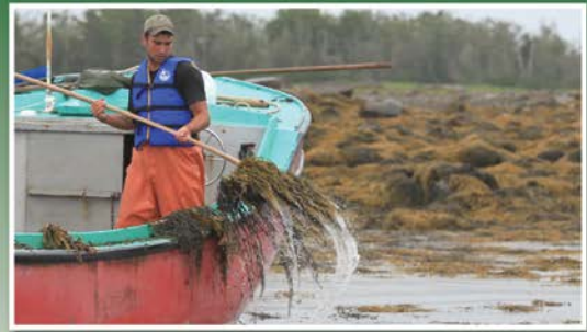
Fertrell Kelp Meal is sustainably hand-harvested

Manufactured by Acadian Seaplants Limited • In Business for Over 30 Years •